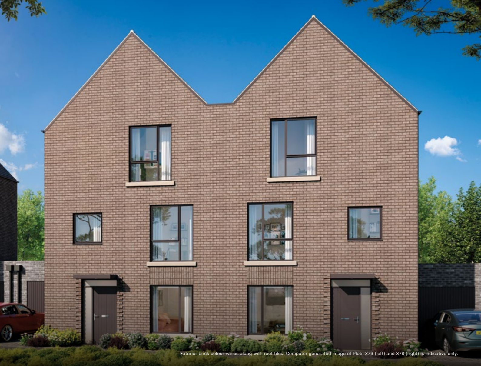
Exterior brick colour varies along with roof tiles. Computer generated image of Plots 379 (left) and 378 (right) is indicative only.